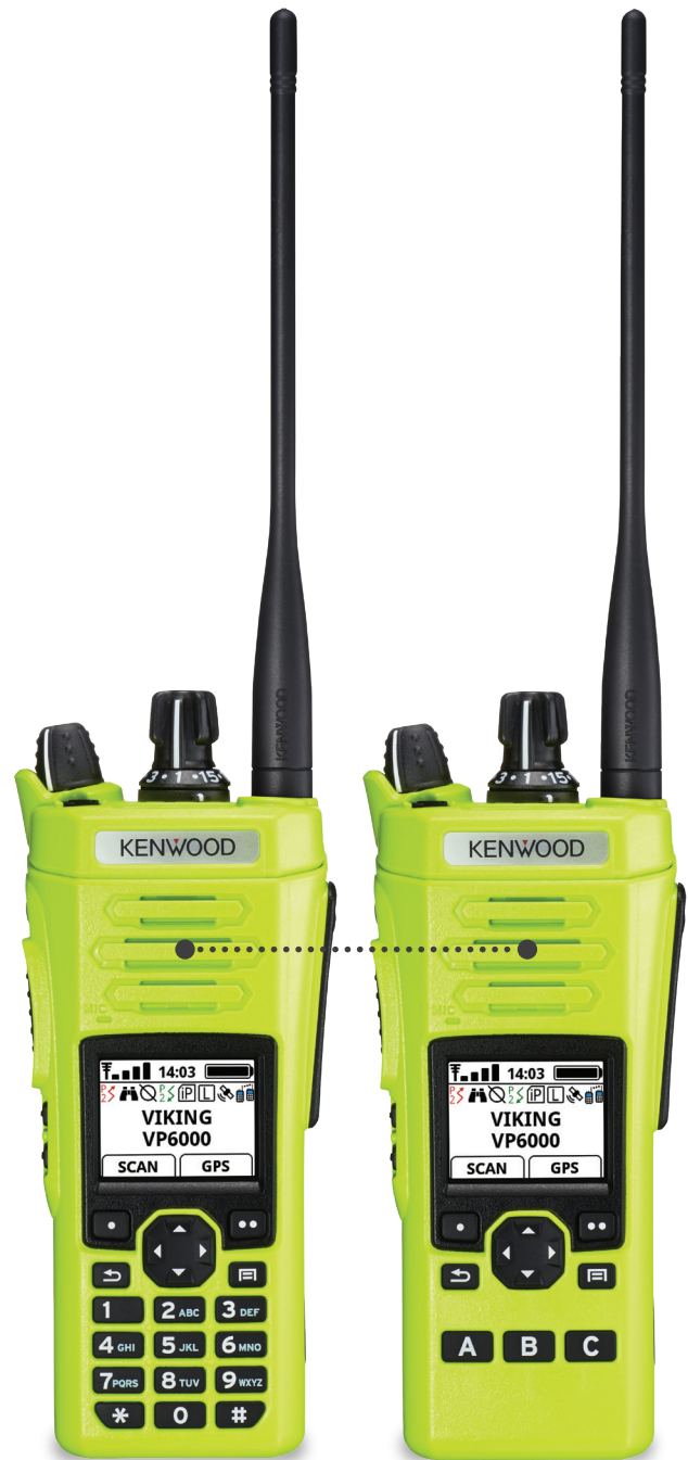
P25 Digital Messaging (Audio can be in analog or P25 digital)

EF Johnson Technologies, Inc. a JVCKENWOOD Company